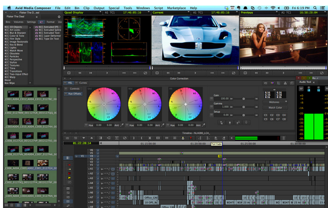
Bundle Artist | DNxIO with Media Composer to maximize your HD and high-res efficiency.